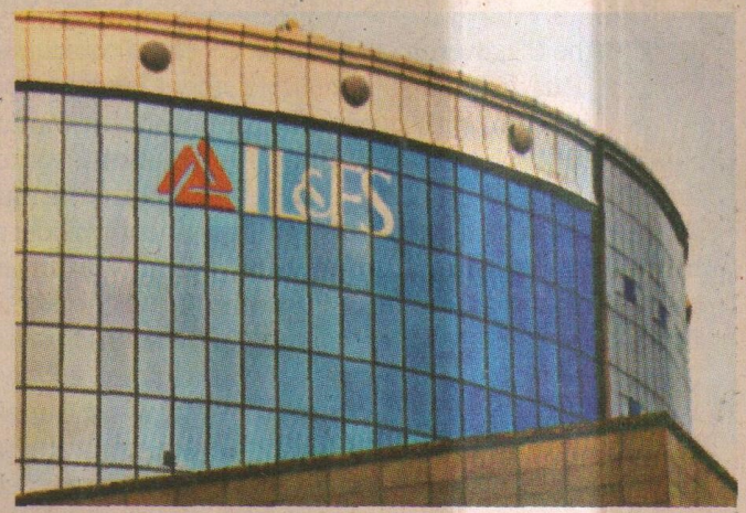
The new board has requested NCLAT to direct banks refusing to invest the cash surplus of IL&FS' group entities in escrow accounts, to create FDs from amounts lying in those accounts

Of these, for the companies under IL&FS' wind portfolio, final bids have been received. In each of these seven Special Purpose Vehicles (SPV), Gail has emerged as the highest bidder, the ministry has said. Japan-based ORIX Corporation, which already holds a 49 per cent stake in these SPVs, has, however, invoked its right of first refusal and expressed its interest to